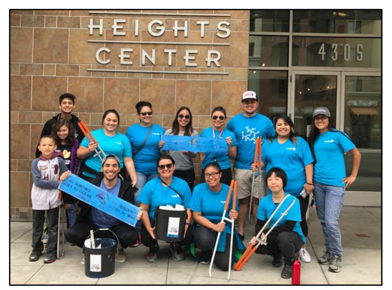
(Above) Many of our rotaractors were up early on Sunday morning to stencil some storm drains around City Heights.

(Below) There were different parts to stenciling. First, the area had to be cleaned. Second, setting the base coat and letting it dry. And finally using the blue paint to stencil the message.